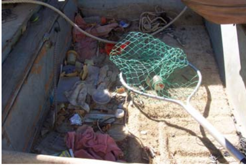
BEFORE Photos of Vessel that Failed Inspection January 17, 2009