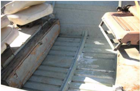
AFTER Photos of Same Vessel on January 18, 2009