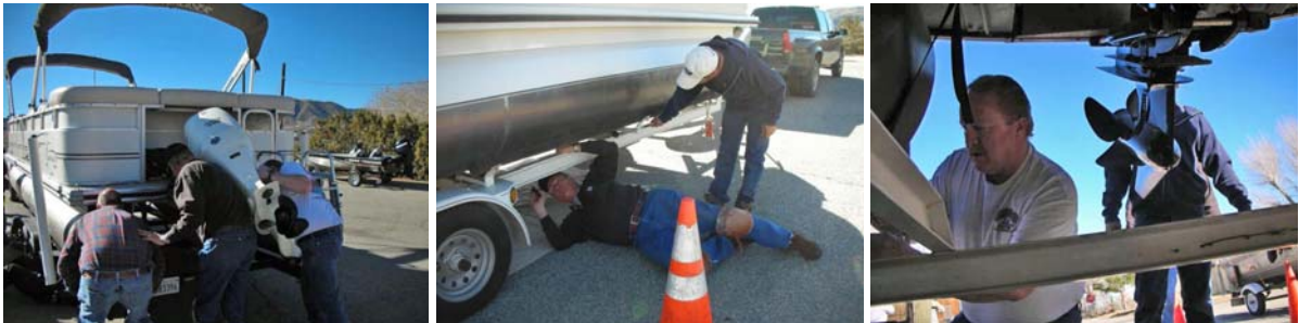
Vessel Inspection January 17, 2009