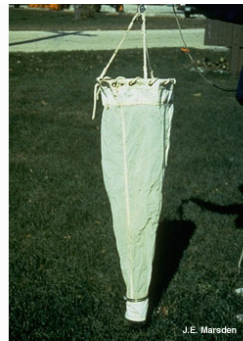
63 micron mesh veliger sampling net