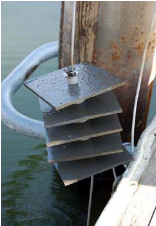
Artificial Substrate Monitoring Assembly